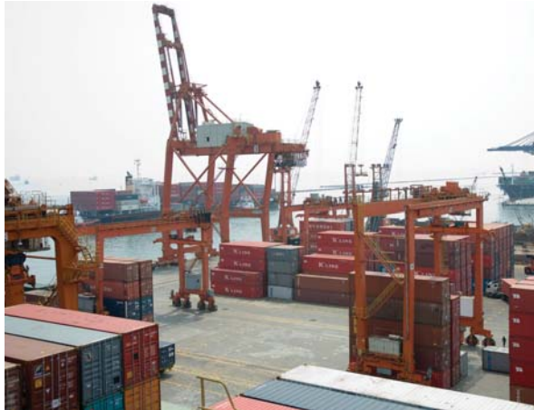
Terminal 300 makes productive use of yard space—70,000 TEUs per hectare.