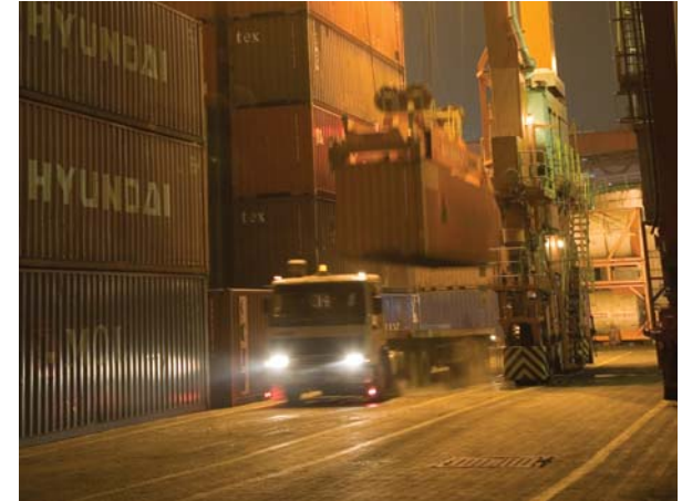
IT solutions and modernized equipment have maximized efficiency.