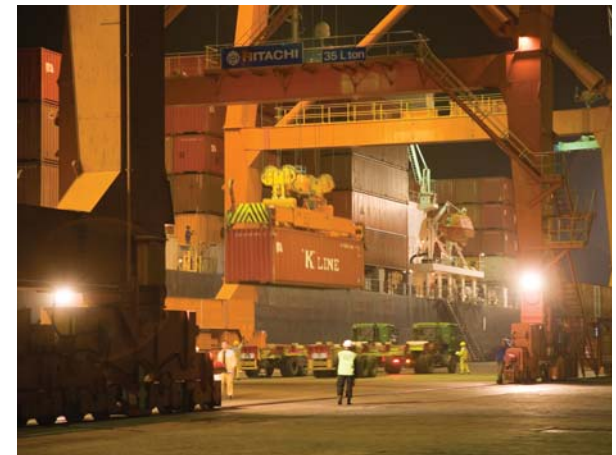
Performance targets for the terminal were achieved in less than one year.